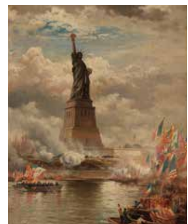
Edward Moran (1829–1901), Enlightening the World, (The Unveiling of the Statue of Liberty) , 1886. Oil on canvas, 49 1/2 x 39 inches. Museum of the City of New York

Sea Knows reveals the diverse ways the sea has been depicted in American art and its connections to the Connecticut shore. A special gallery will unite, for the first time, paintings from MCNY's collection with selections from the Museum's collection that depict ships of the Black X Line. In addition, letters to Captain Griswold from his wife are being transcribed and will be the basis for an online theatrical presentation that will provide insight into the lives of sea captains and those left behind, as well as how the shipping industry affected the