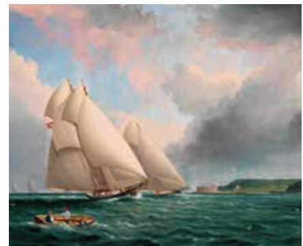
James Edward Buttersworth (1817–1894), Yacht Race off Fort Wadsworth , ca. 1870. Oil on board, 9 1/4 x 12 1/4 inches. Museum of the City of New York

This is your invitation to the Members' Reception. We hope you can join us. Kindly RSVP (acceptances only) to 860-434-5542 ext. 122 or Sarah@flogris.org.