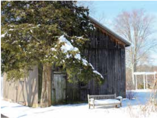
Winter can be hard on any property. The Annual Fund helps support the maintenance of the eleven-acre historic site throughout the year.