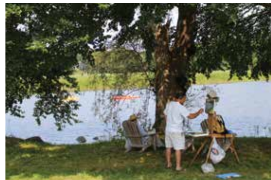
Kayakers, relaxers, and artists—it's a picture perfect day.