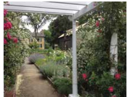
We think Miss Florence would be pleased to have her gardens be a part of this bloom-filled group!

It doesn’t seem like it could be fourteen years since a group of nine Connecticut historic sites, including the Florence Griswold Museum, got together to market their very special gardens. Over the years the group has raised awareness of the state’s historic gardens and increased visitation to our member sites. We stay connected and engage audiences through a website and an active Facebook page. A new feature that has been very well received is Weed Our Blog . Begun in June, 2014 the twice-monthly blog offers beautiful photographs and gardening tips and musings from the sites’ Master Gardeners. Outreach events, speaking engagements, publicity, and an art contest, keep the historic properties blooming in hearts and minds of garden lovers!