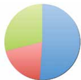
OPERATING REVENUE & SUPPORT