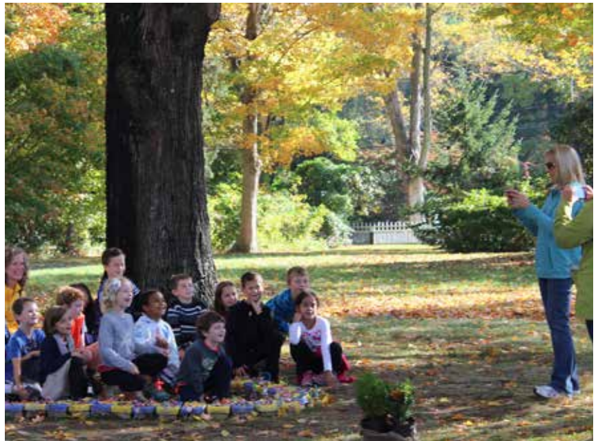
All 150 students from Deep Elementary School visited Wee Faerie Village. Students and teachers alike were very proud of their work! Many children brought their parents back on the weekends to show off their work!

Collaboration is at the heart of the Museum's comprehensive development program. We ended the year with 2,859 members who support the Museum and participate actively as volunteers and program attendees. The Annual Fund