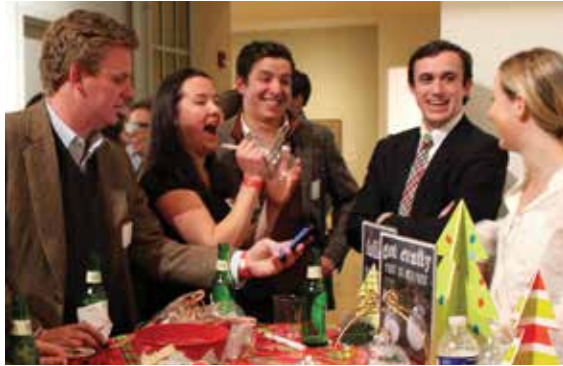
The evening proved to be a great way to introduce guests to all that the Museum has to offer (and to each other!)

ON FRIDAY , November 28, 2014, FGM hosted its first Holiday Social for Young Professionals, a festive event that attracted over 60 guests from across the state and beyond. Attendees enjoyed socializing, viewing the Life Stories in Art exhibition, listening to the acoustic