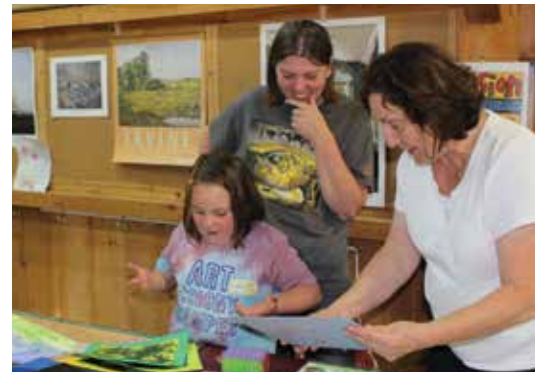
Campers share (with great pride) their work at the end of each week.