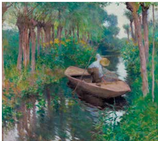
On the River makes its debut in the Florence Griswold House this summer.

IN 1883 , Willard Metcalf joined the ranks of American artists who traveled to France to further their education. He spent five years abroad, studying in Paris at the Académie Julian and visiting art colonies at Pont-Aven, on the Brittany Coast, Walberswick, England, and Grez-sur-Loing near Barbizon in the summers. In May 1885, as documented by bird eggs he collected while there, Metcalf became the first American artist to spend time in Giverny, the French town not far from Paris that would become home to a large art colony attracted by the presence of Claude Monet. While Monet largely ignored the community of expatriate painters, Metcalf managed to make his acquaintance and even tutored the artist's son and stepson in botany and ornithology. Metcalf returned to Giverny for the next two summers, and painted On the River , ca. 1888.