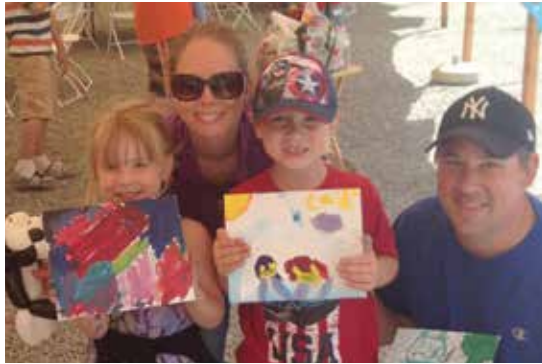
Outreach event at Sails Up 4 Cancer for the Sunshine Kids at the Mystic Shipyard.

Educational services lie at the heart of the Museum's mission. "To foster the understanding of American art, with emphasis on the art, history, and landscape of Connecticut" is a goal that has touched thousands of students whose schools are listed below.