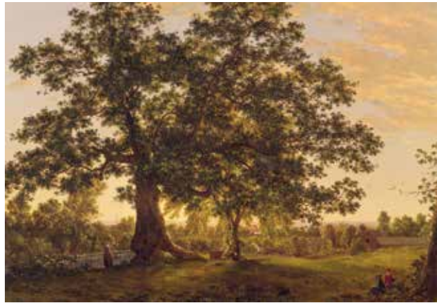
Frederic E. Church, The Charter Oak at Hartford , c. 1846. Florence Griswold Museum

WHAT IF YOU could find the best of the best landscape paintings of Connecticut in one place? This fall's exhibition, The Artist in the Connecticut Landscape , marks the completion of an expansive online project to contribute over 400 digital images to Connecticut History Online (CTHistoryOnline.org), a decade-old collaborative digital library of over 15,000 drawings, prints, and photographs depicting historic images of Connecticut. The paintings in this statewide database are from the collections of the Connecticut Historical Society, the Connecticut State Library, the Florence Griswold Museum, the Lyman Allyn Museum, the Mattatuck Museum,