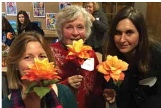
Look for this summer’s Art•Bar lineup at FlorenceGriswoldMuseum.org .

YOU GET a wildly successful program. Art•Bar Happy Hours sell out—some a month in advance. Is it the time spent with friends? The snacks and signature