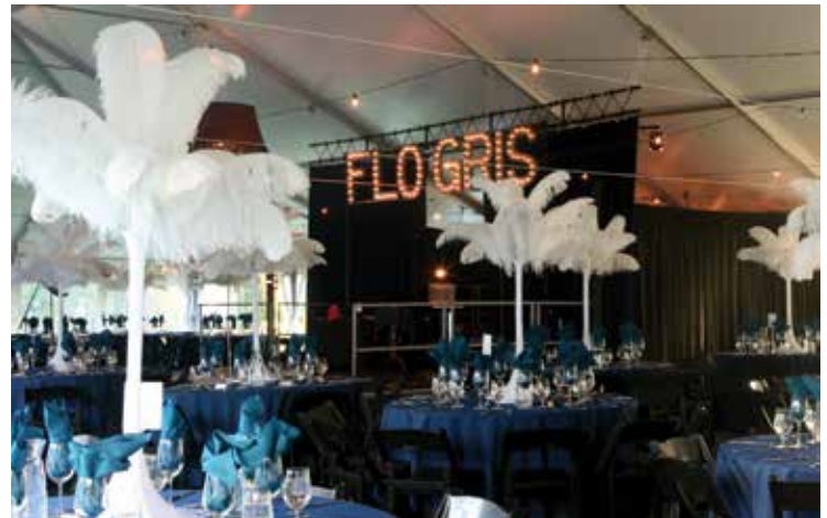
The Benefit Auction Steering Committee is all about the details. From finding impressive items for bidding and the perfect band and dinner, to memory-making decor, the annual Benefit Auction Dinner and Dance is one of the area's not-to-be-missed events.