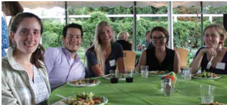
The Museum is proud to have dedicated young volunteers.