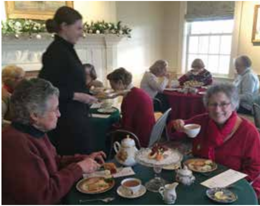
The Magic of Christmas Teas are a favorite tradition.