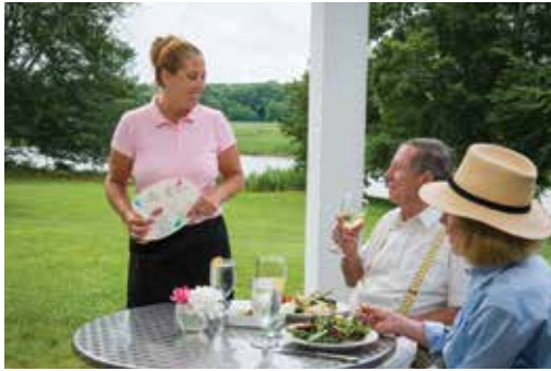
CAFÉ FLO OPENS MAY 1. Enjoy lunch overlooking the river Tuesday through Sunday. Details page 9.

96 Lyme Stree Old Lyme, Connecticut 06371 FLORENCEGRISWOLDMUSEUM.ORG